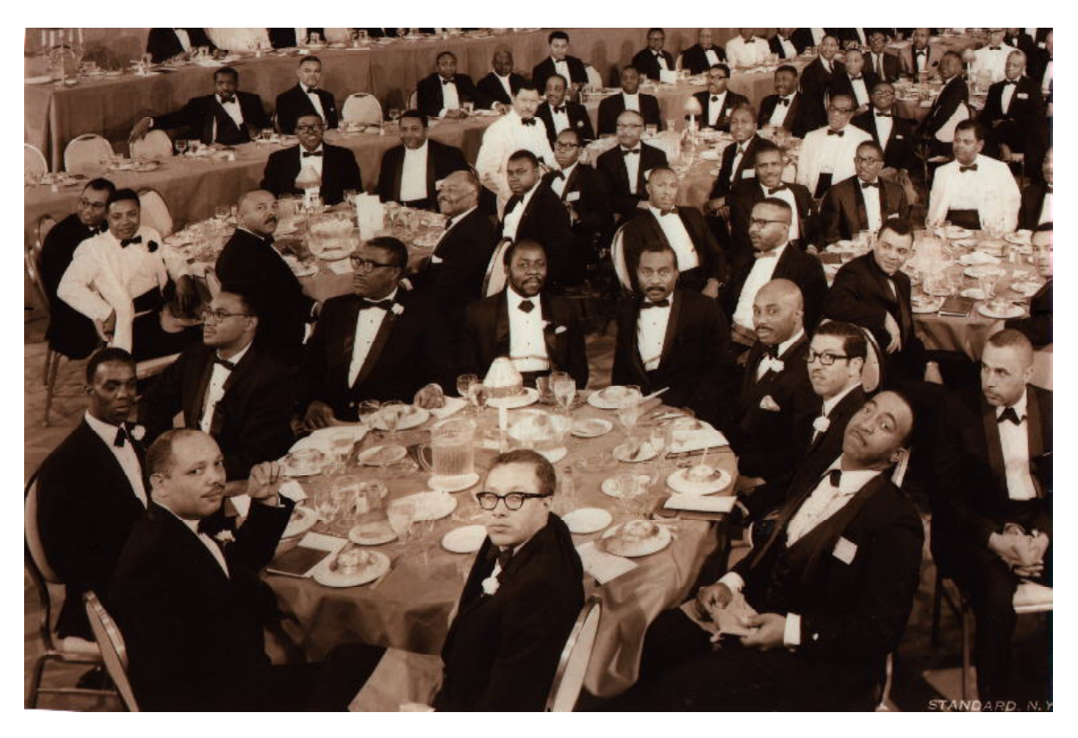
Chapter Chartered brothers at Kappa Alpha Psi Province meeting at the New York Hilton May 3-5, 1968 (foreground table)