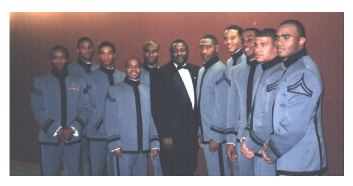
Kappa Mu brothers from West Point Military Academy attending Poughkeepsie Alumni 1999 Fall Dance